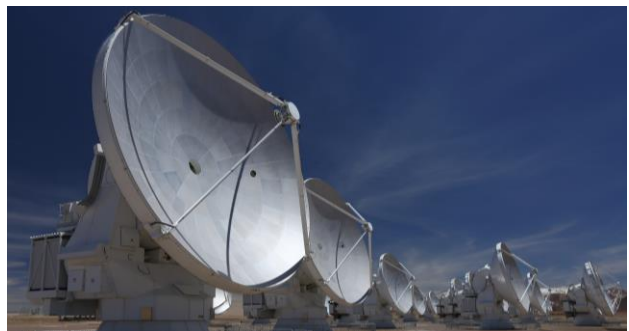
ALMA radio telescopes observatory