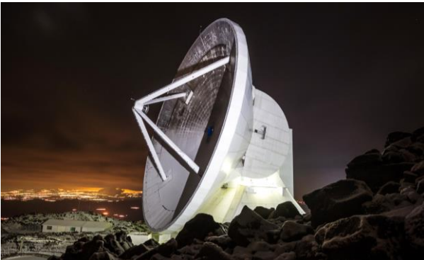
Large Millimeter Telescope (LMT)

The photo was obtained linking several ground-based radio telescopes and arrays. Media Lario is proud to have supplied the optics for several of the ground-based observatories including the ALMA array in Chile, the Large Millimeter Telescope (LMT) in Mexico and the IRAM 30-meter telescope in Spain.